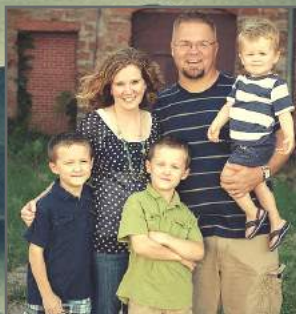
The Taliaferro Family