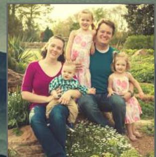
The Duncan Family